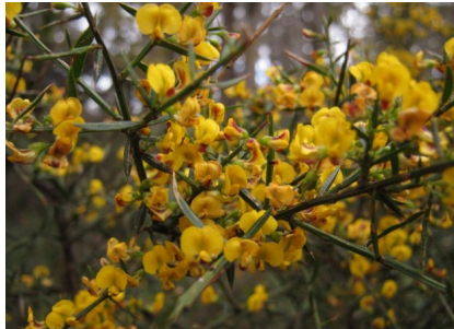
BC Daviesia sejugata

shrub; broad leaves with obvious venation; gold & brown pea flowers