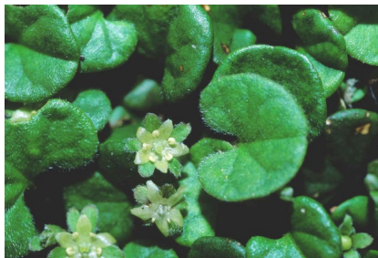
GJ Dichondra repens

perennial to 1.5m; leaves long, narrow, margins serrated; flowers on long stalks, 6-petalled, blue; fruit a blue/purple shiny berry