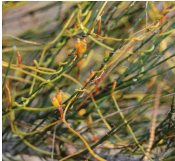
GJ Cassytha glabella

dolly bush shrub to 3 m; large clusters of small white flowers