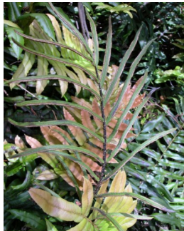
GJ Blechnum watsii

hard waterfern fronds dark green, divided only once, fertile fronds different