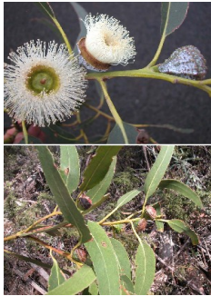
GJ Eucalyptus globulus

black peppermint tree 15 to 30 m with fine rough bark; leaves narrow; buds 7-15+