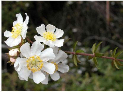
GJ Bauera rubioides

wiry bauera sprawling wiry shrub; leaves opposite, each with three leaflets; flowers white to pink