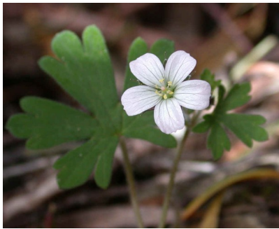
RW Geranium potentilloides

common native-cherry tree; conifer-like foliage; edible orange coloured fruit