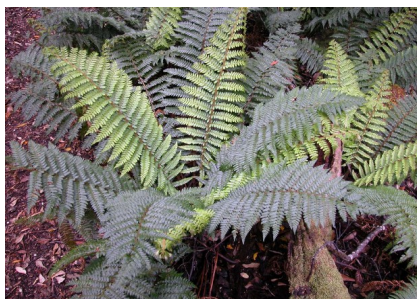
GJ Polystichum proliferum

shrub to 2m; leaves round, dark green, shiny above, white & hairy below; flowers tubular, in spherical heads