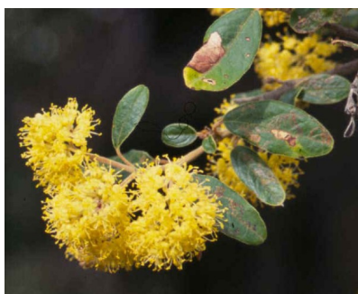
GJ Pomaderris elliptica