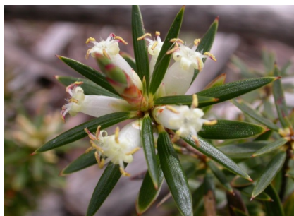
RS Cyathodes glauca

curling everlasting herb with single golden daisy flower heads on long stems