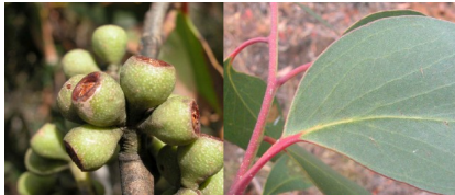
GJ Eucalyptus obliqua

tasmanian bluegum tree to 70m high, trunk rough at base, smooth, greyish/white above; leaves lance-shaped to 30cm long; fruit large, ribbed