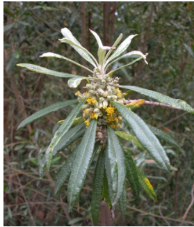
GJ Bedfordia salicina

wiry bauera sprawling wiry shrub; leaves opposite, each with three leaflets; flowers white to pink