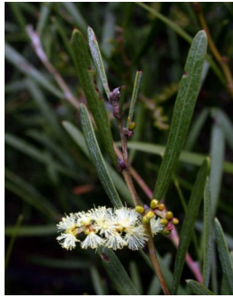
RW Acacia mucronata

caterpillar wattle shrub/tree to 10m; leaves leathery, narrow, to 15cm; flowers cream/yellow in spikes