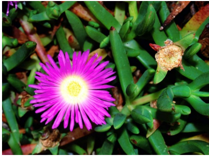
GJ Carpobrotus rossii

native pigface herb, prostrate, spreading; leaves fleshy, triangular x-section; flowers large, pink/purple, white centres