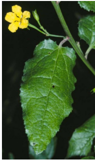
GJ Goodenia ovata

hop native-primrose shrub to 2m; leaves bright green, to 6cm, edges toothed; flowers yellow with petals in two groups