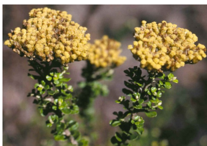
GJ Ozothamnus obcordatus