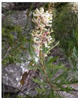
GJ Lomatia tinctoria

sagg tussock of strap-like leaves with notched ends; flowers in spiny clusters