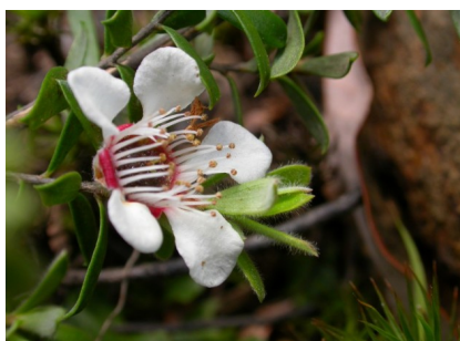
RS Leptospermum lanigerum

woolly teatree shrub or small tree; leaves hairy; flowers white, hairy at base; fruit hairy at base