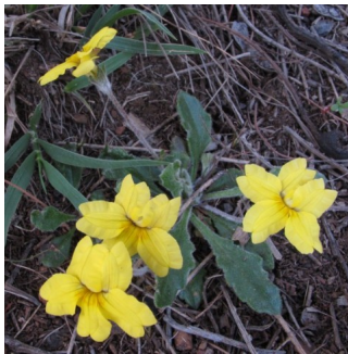
RS Goodenia lanata

forest raspwort perennial herb to 60 cm; leaves oval and rough to touch; flowers on leafy spikes with petals often fallen.