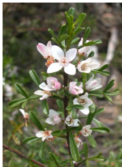
GJ Boronia anemonifolia

hard waterfern fronds dark green, divided only once, fertile fronds different