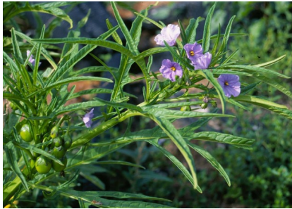
GJ Solanum laciniatum

common fireweed perennial herb to 2m; leaves narrow linear; yellow daisy flowers in clusters