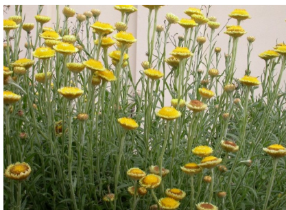
RS Coronidium scorpioides

native currant erect shrub to 4m; leaves to 10mm; flowers, male & female on separate plants, 4 white petals; fruit shiny red/orange