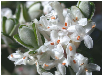
RW Pimelea nivea

herb growing in rock crevices; leaves kidney-shaped; flowers pink/white