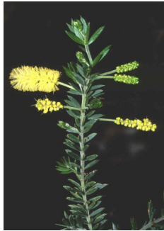
GJ Acacia verticillata

caterpillar wattle shrub/tree to 10m; leaves leathery, narrow, to 15cm; flowers cream/yellow in spikes