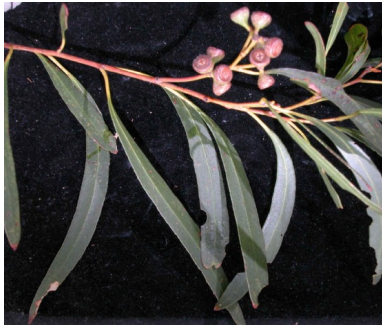
GJ Eucalyptus amygdalina

black peppermint tree 15 to 30 m with fine rough bark; leaves narrow; buds 7-15+