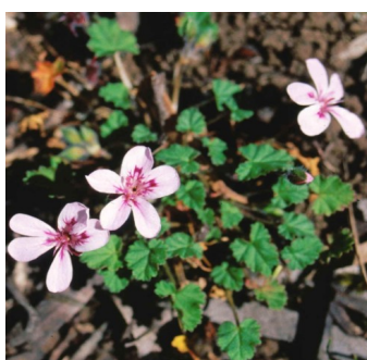
GJ Pelargonium australe

Shrub .5-1.5m, heart-shaper alternate leaves, glossy on top, hairy below, terminal tight clusters of yellow flowers massed in spring