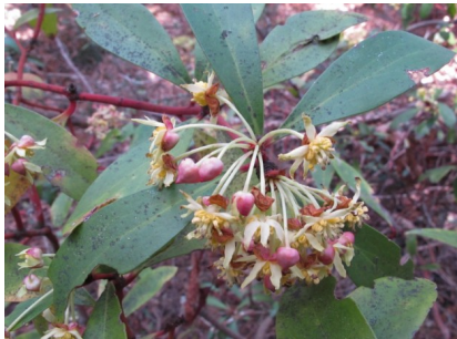
RS Tasmannia lanceolata

pink beardheath erect woody shrub to 1m; leaves to 13mm, edges turned down; flowers numerous along branches, white, tubular, hairy inside