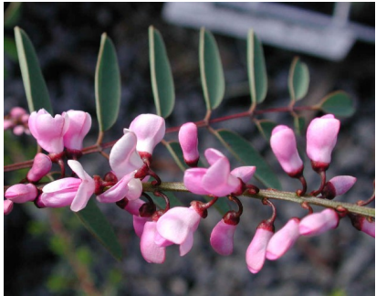
RW Indigofera australis

erect guineaflower shrub; narrow leaves; golden 5-petalled flowers