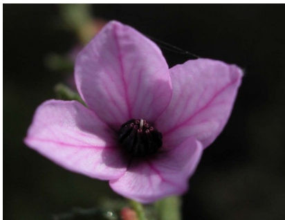
GJ Tetratheca labillardierei

mountain pepper tree to 5m; leaves lance-shaped on red stems; flowers yellow; fruit red turning black