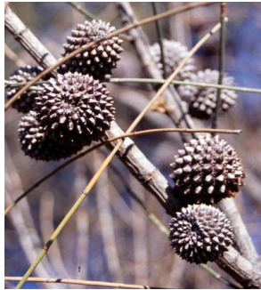
GJ Allocasuarina verticillata

necklace sheoak shrub to 4m; leaves like tiny teeth around joints in neele-like branchlets; fruit, cylindrical cones with pointed ends