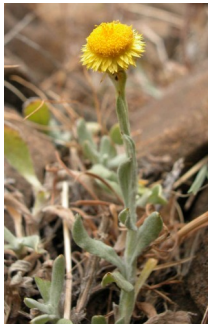
GJ Chrysocephalum apiculatum

slender dodder laurel slender parasitic twiner; appears leafless; tiny white flowers in bunches on short stalks