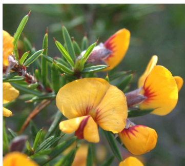
RW Pultenaea juniperina

orchid with single green nodding flower on stem to 30cm