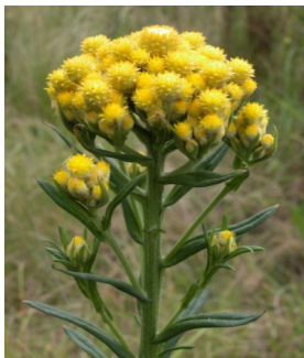
GJ Chrysocephalum semipapposum

common everlasting perennial herb to 50cm; stem & leaves densely hairy; golden daisy flowers in clusters