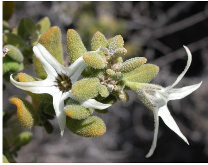
GJ Cyphanthera tasmanica