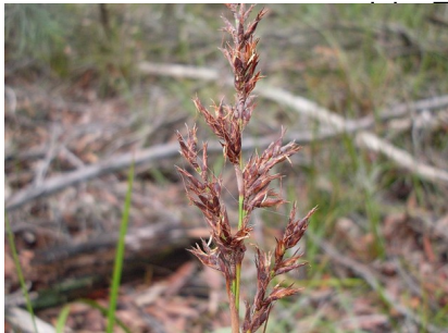
ann Lepidosperma concavum

native indigo shrub to 1.5m high; leaves feather-like, to 10 leaflets; pea flowers pink/mauve, crowded along branches