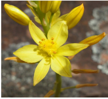
GJ Bulbine glauca

bluish bulbine-lily herb; soft hollow leaves tufted at base; spike of 6-petalled yellow flowers, no tuber