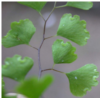
GJ Adiantum aethiopicum

common buzzy herb; leaves divided; balls of flower/seeds with hooks