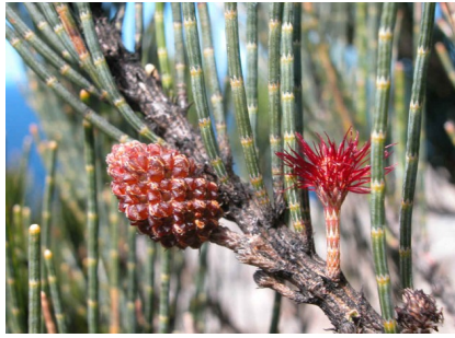
GJ Allocasuarina monilifera

necklace sheoak shrub to 4m; leaves like tiny teeth around joints in neele-like branchlets; fruit, cylindrical cones with pointed ends