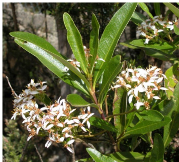
GJ Olearia viscosa

dusty daisybush shrub to 1.5m; leaves hairy under, margins somewhat toothed; white daisy flowers to 2 cm diam.