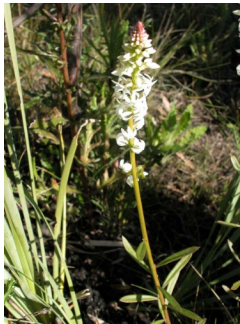
GJ Stackhousia monogyna

kangaroo apple shrub; lobed leaves; large purple flowers; yellow/orange fruit