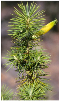
GJ Stenanthera pinifolia

Small shrub, pine-needle like leaves and creamy white flowers. Used to be Astroloma pinifolia