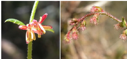
GW Gonocarpus teucrioides

geranium herb; lobed leaves; pink flowers; "storksbill" fruit