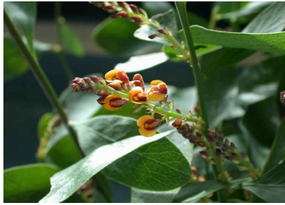
GJ Daviesia latifolia

Shrub with short hairs on leaves, making them bluish and felt like, with distinctive, 5 lobed "starfish" white flowers with blue throats