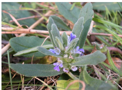
GJ Ajuga australis

common maidenhair delicate plant with fan-shaped leaves