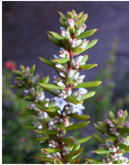
GJ Styphelia ericoides

narrowleaf triggerplant herb to 50cm; leaves narrow, strap-like; flowers pink, four- petalled, in spikes