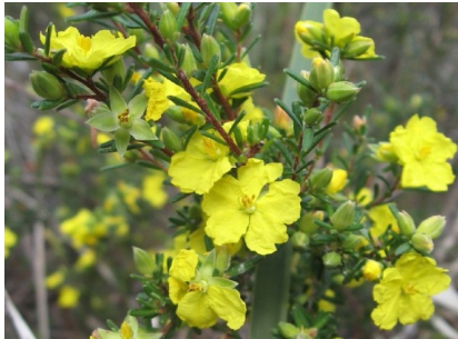
BC Hibbertia riparia

hop native-primrose shrub to 2m; leaves bright green, to 6cm, edges toothed; flowers yellow with petals in two groups