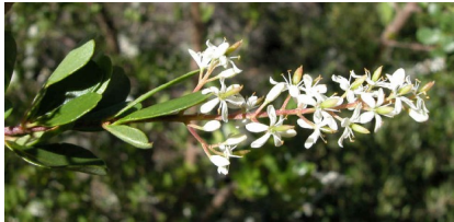
GJ Bursaria spinosa

bluish bulbine-lily herb; soft hollow leaves tufted at base; spike of 6-petalled yellow flowers, no tuber