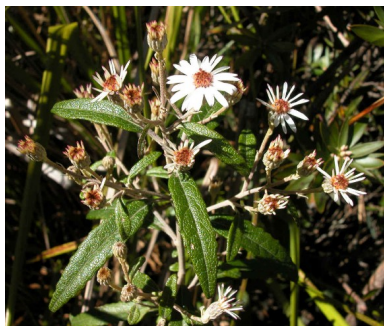
GJ Olearia phlogopappa

forest daisybush shrub to 5m; numerous white daisy flowers at ends of branches