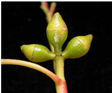
GJ Eucalyptus viminalis

black gum large gum tree; rough grey bark; oval leaves