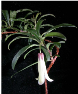
GJ Billardiera longiflora

tasmanian blanketleaf shrub/tree to 5m; leaves dark green above silver hairy below; yellow daisy flowers in groups