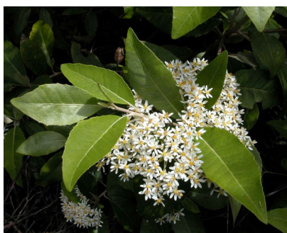
GJ Olearia argophylla

musk daisybush shrub/tree to 15 m; large leaves with silver back; flowers in large crowded heads.