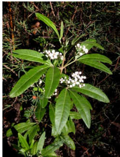
GJ Zieria arborescens

stinkwood shrub/tree to 8 m; leaves with 3 leaflets to 10 cm with unpleasant smell when crushed; flowers with 4 white/pink petals.