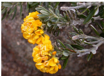
RS Oxylobium ellipticum

viscid daisybush shrub to 2m; leaves elliptical, 5-8cm long, sticky, dark green above, light green, hairy under; daisy flower heads with 4-6 white "petals" in crowded terminal clusters