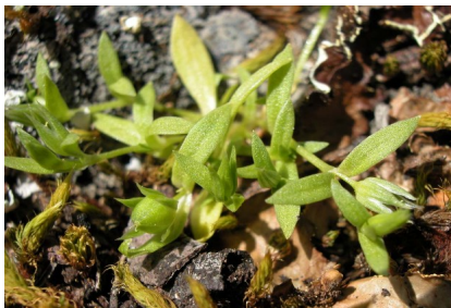
GJ Stellaria multiflora

forest candles herb to 50cm. several erect stems; leaves narrow; flowers white tubular in dense spikes at ends of stems.