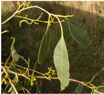
GJ Eucalyptus ovata

stringybark tree to 90m; trunk & branches covered in soft, ridged bark; leaves very unsymmetrical;