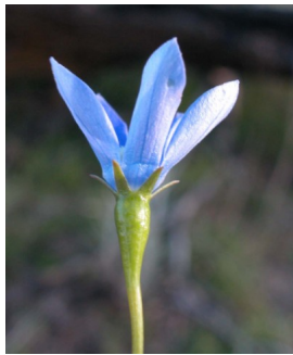
GJ Wahlenbergia stricta

ivy-leaf violet herb; perennial, spreading; kidney shaped leaves; violet flowers on stalks