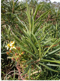
GJ Senecio linearifolius

matted bushpea shrub; prostrate; golden pea flowers on stalks