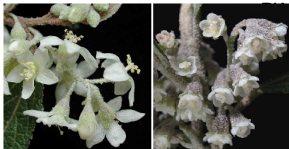
GJ Asterotrichion discolor

golden pea shrub to 1.5m; leaves narrow to 12mm long, margins downrolled; yellow pea flower with red throat