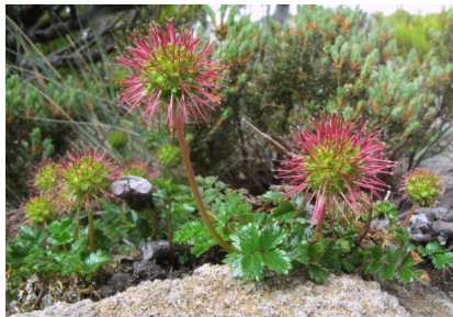
RS Acaena novae-zelandiae

prickly moses shrub 50cm to 6m high; leaves in whorls, narrow pungent pointed, to 2cm long; flowers in cylindrical yellow spikes