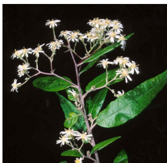
GJ Olearia lirata

musk daisybush shrub/tree to 15 m; large leaves with silver back; flowers in large crowded heads.