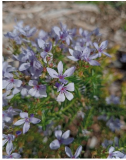
AS Veronica formosa

common speedwell bush shrub to 2 m; leaves crowded, green, to 1.5 cm long; flowers 4 petals usually pale blue/mauve, clustered.