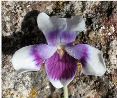
GJ Viola hederacea

common speedwell bush shrub to 2 m; leaves crowded, green, to 1.5 cm long; flowers 4 petals usually pale blue/mauve, clustered.