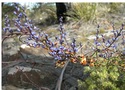
GJ Comesperma volubile

mountain clematis climber; leaves multi-lobed; large white star-like flowers