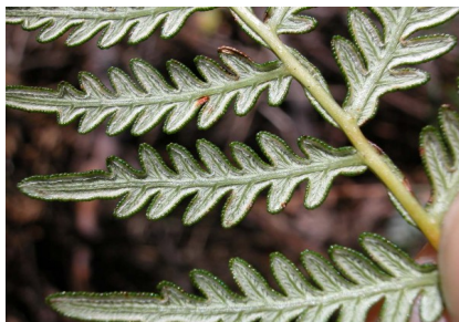
GJ Pteridium esculentum

shrub to 4m high; leaves ovate, to 5cm long, hairy under; flowers cream/yellow, 5-petalled, in pyramidal clusters