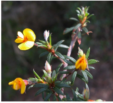
RW Pultenaea pedunculata

matted bushpea shrub; prostrate; golden pea flowers on stalks