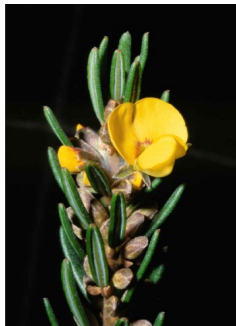
GJ Aotus ericoides

drooping sheoak tree with "leaves" hanging down or drooping