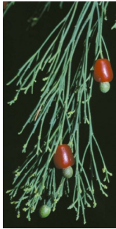
GJ Exocarpos cupressiformis

rosy heathmyrtle shrub to 50cm; leaves linear to 10mm; flowers ca 10mm diam, 5 white/pink petals