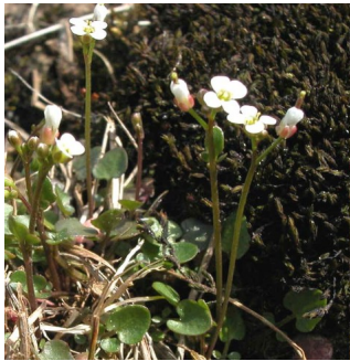
GJ Cardamine gunnii

pink fingers herb to 25 cm; single narrow narrow; 1 to 6 showy pink flowers