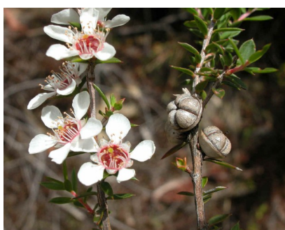
GJ Leptospermum scoparium

woolly teatree shrub or small tree; leaves hairy; flowers white, hairy at base; fruit hairy at base