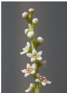
GJ Leptomeria drupacea

erect currantbush Much branched shrub to 2 m; leaves are tiny scales on stem; flowers very small, cream; fruit fleshy, reddish.