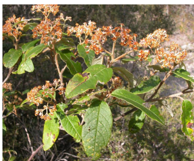
GJ Pomaderris intermedia

similar to P. elliptica except entire leaf undersurface is hairy in P. intermedia