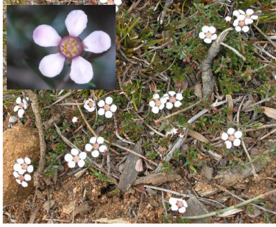
GJ Euryomyrtus ramosissima

rosy heathmyrtle shrub to 50cm; leaves linear to 10mm; flowers ca 10mm diam, 5 white/pink petals