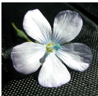
GJ Linum marginale

common teatree shrub to 4m; leaves to 2cm with prickly pointed tips; flowers white; fruit with 5 slits, top convex, woody