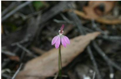
JC Caladenia carnea

prickly box small tree; distinctive "purses" (seed cases); white starry flowers