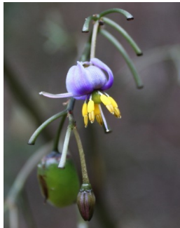
BC Dianella tasmanica