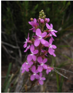
BC Stylidium graminifolium

Small shrub, pine-needle like leaves and creamy white flowers. Used to be Astroloma pinifolia