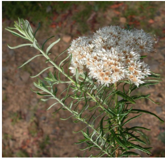
GJ Cassinia aculeata

native pigface herb, prostrate, spreading; leaves fleshy, triangular x-section; flowers large, pink/purple, white centres