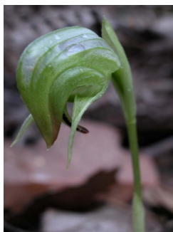
GJ Pterostylis nutans

common fern to 2.5m tall; leathery much divided frond