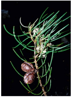
GJ Hakea lissosperma

trailing native-primrose prostrate herb; leaves to 7cm, dark green above lighter below; flowers golden, asymmetric on long stem