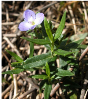
GJ Veronica gracilis

slender speedwell herb to 10cm; leaves narrow lance-shaped, to 3.5cm; flowers blue, four petalled