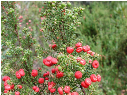
RW Leptecophylla parvifolia

blue bottledaisy rosette herb; leaves hairy, to 8cm long; single flower head white or purplish on long hairy stem