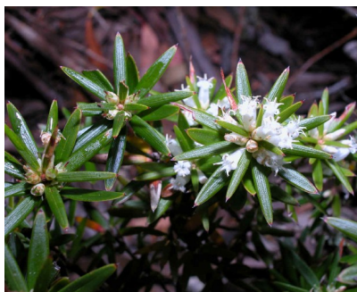
GJ Cyathodes straminea

shrub to 3m; leaves pointed, to 5cm, green above whitish below; flowers tubular, white; fruit fleshy, white to red