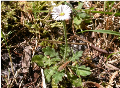
RS Lagenophora stipitata

mountain needlebush small tree to 6m; leaves cylindrical sharply pointed; flowers white; fruit almost round with short beak and warty surface