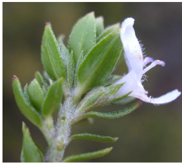
GJ Westringia rubiifolia

subsp. betonicifolia showy violet rosette herb to 6cm; leaves erect, lance-shaped; flowers violet on long stem