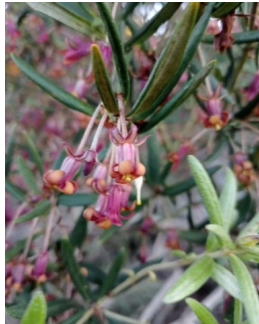
AS Pittosporum bicolor

bushmans bootlace shrub to 2m; leaves round, dark green, shiny above, white & hairy below; flowers tubular, in spherical heads