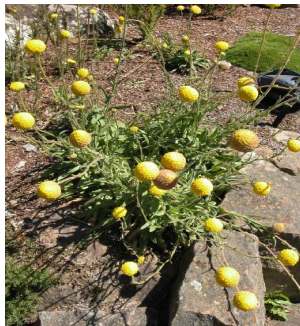
GJ Craspedia glauca

shrub to 2m; leaves small elliptical; flowers small; fruit spherical, orange/red