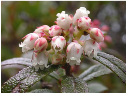
RS Gaultheria hispida

subsp. tasmaniensis gumtopped stringybark tree to 50m; stringy bark on most of trunk, branches white; leaves asymmetrical.