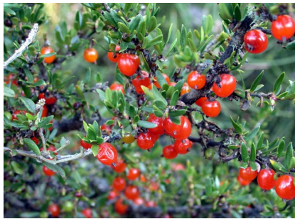
RW Coprosma nitida

herb perennial, to 30cm high; leaves spoon-shaped, to 6cm long; flower head usually mauve, to 4cm diam, on long stalk