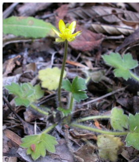
GJ Ranunculus lappaceus

prickly beauty shrub to 2.5m; leaves to 12mm, sharp pointed; golden pea flowers at ends of branches