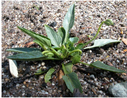
GJ Viola betonicifolia

slender speedwell herb to 10cm; leaves narrow lance-shaped, to 3.5cm; flowers blue, four petalled